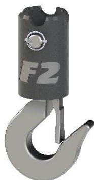
FRG GANCIO ROTANTE ROTATING HOOK