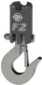
FRG S GANCIO ROTANTE E BASCULANTE ROTATING AND TILTING HOOK